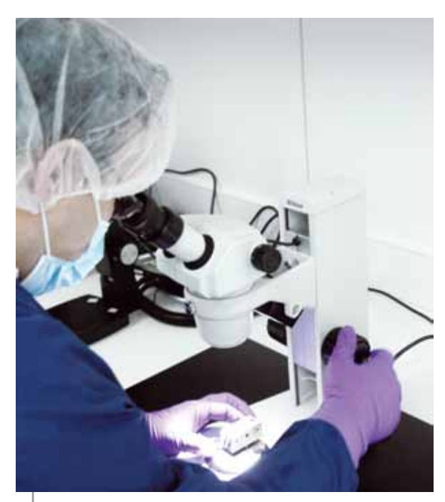
In addition to the iNexiv CNC video measuring system, FMI uses many stereomicroscopes from Nikon.