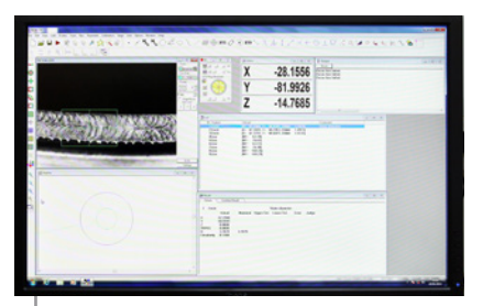
The iNEXIV VMA-4540's PC screen shows an image of the area of the component under inspection, current point coordinates, a list of the features inspected, any that are out of tolerance, and more.